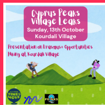
Images from the activities in scope of the Time to Move campaign.