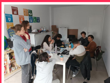
Images from various activities in scope of the Green-It Up project