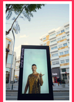
Images from Art.Act.Disrupt public interventions