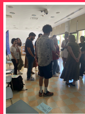
Images from YSI-ACT focus groups and partners' meeting in Cyprus

For more information about the YSI-ACT project click here .