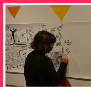
Images from Superheroes Multiplier event

Visit this link , to explore more resources, and more information on activities of the project! These include: