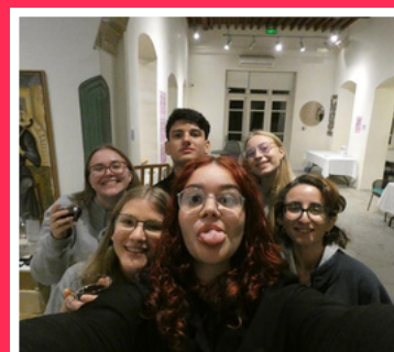
Images from various activities in scope of the Learning League project