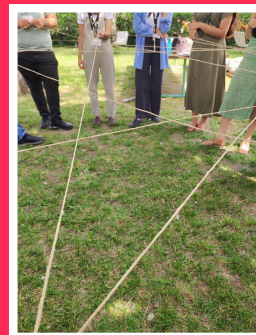
Images from SEXEDU training course in Italy

For more information about the SEXEDU project and access to the Resource Book, click here .