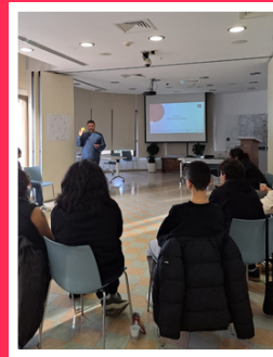
Images from local activities with youth